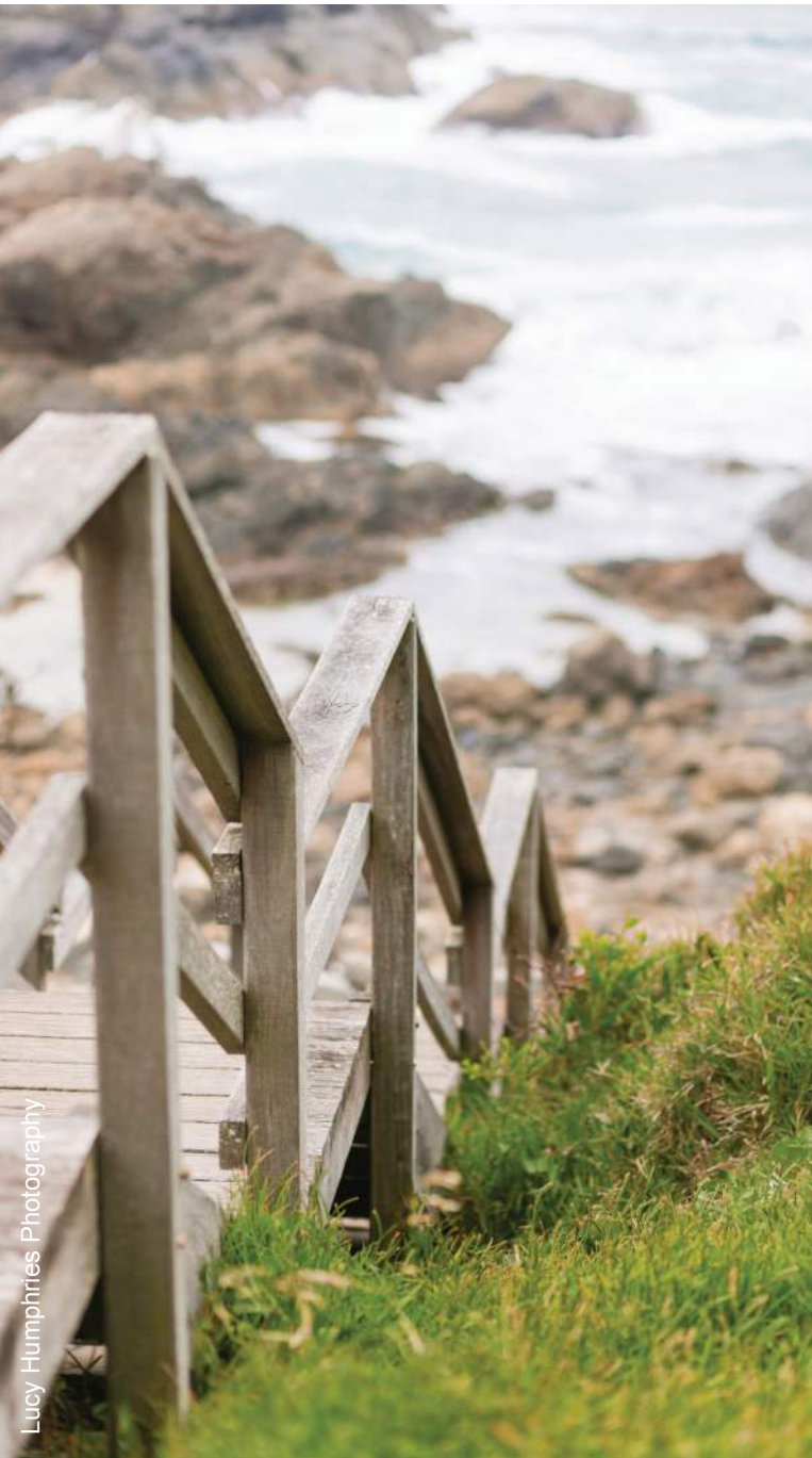
Lucy Humphries Photography