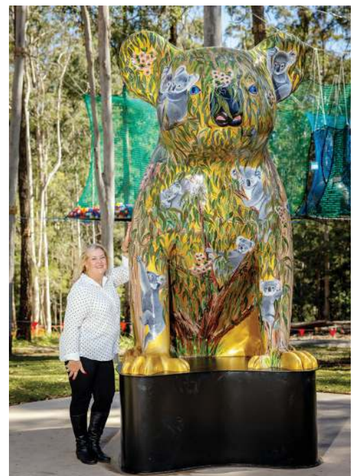
The Big Koala at WildNets